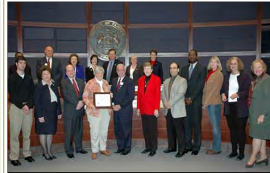
Northern Virginia Soil and Water Conservation District ( High Resolution Photo )