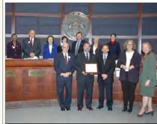
Wetland Studies and Solutions, Inc. ( High Resolution Photo )