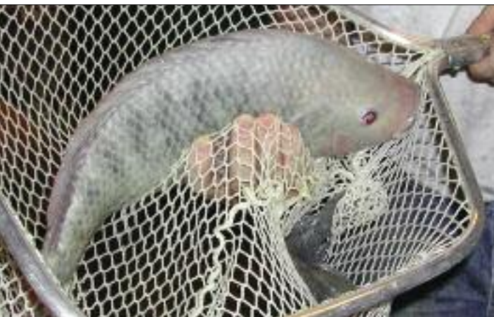
Woods shows tilapia to Tazwell County students on a tour of the center.