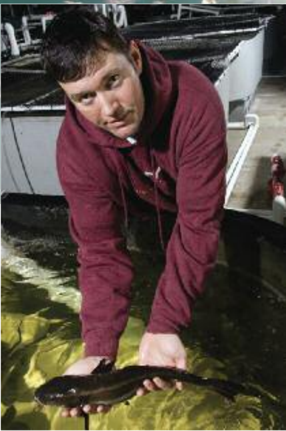
The cobia is the aquaculture center's main focus of research.